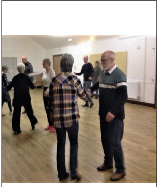
Ballroom Dancing Session