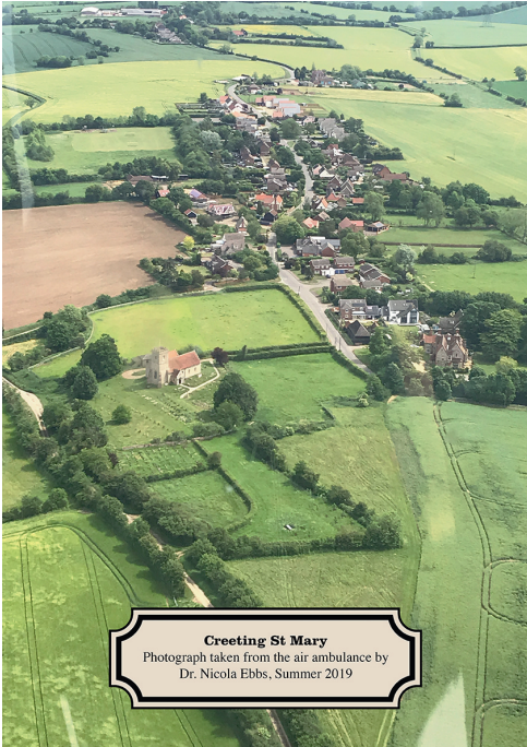
Creeping St Mary