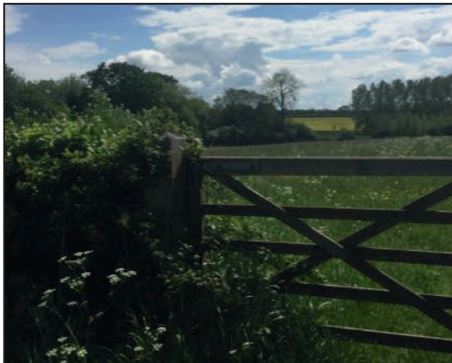
some of the lovely CSM countryside; photo by Jaqui Mann