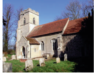
St. Peter's Church Creeting St. Peter