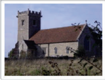
St. Mary's Church, Creeting St Mary