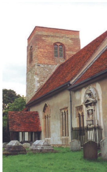
St Mary's Church Badley

All proceeds in aid of Church's Conservation Trust .