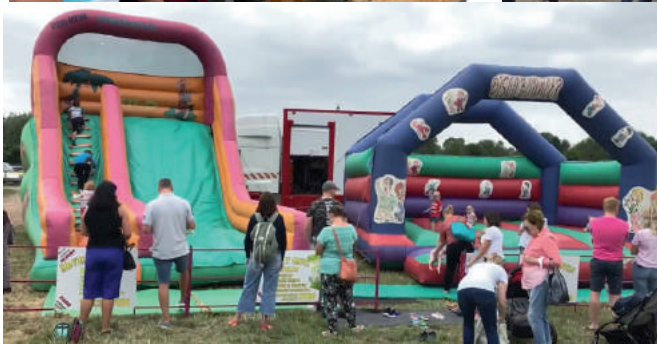
Scenes from the Summer Fayre