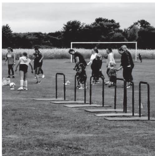
Overpower Family Boot Camp, Blacksmith's Field, 19th July