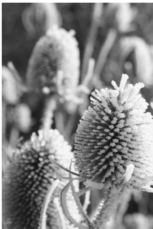
Winter Teasels

A voluntary aided (VA) school has its running costs provided by the Local Authority but a foundation or trust (usually religious and here is Church of England), contributes to capital costs and has a substantial influence in the running of the school, retaining influence over school admission policies, staffing and curriculum.