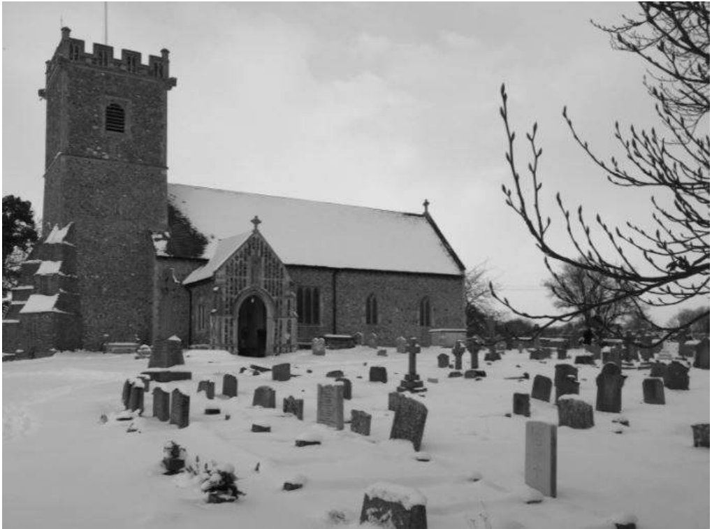
photo: St. Mary's Church