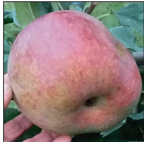
PEASEGOOD NONSUCH enormous cooker /eater