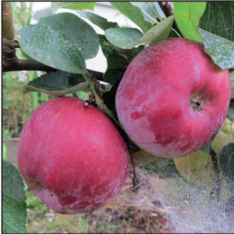
SPARTAN sweet crisp eater