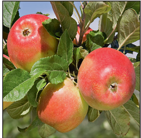
EARLY WINDSOR crisp and juicy

Don't miss the traditional English apple season