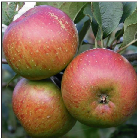
LORD LAMBOURNE crisp aromatic

Don't miss the traditional English apple season