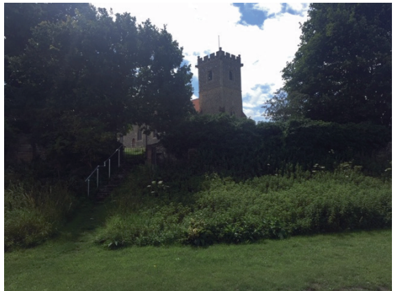
St. Mary's Church from Low Lane