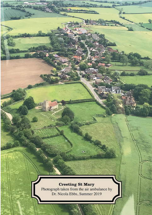
Creting St Mary