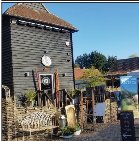
Suffolk Wildlife Trust Swift boxes high on the Dovecote at Alder Carr Farm