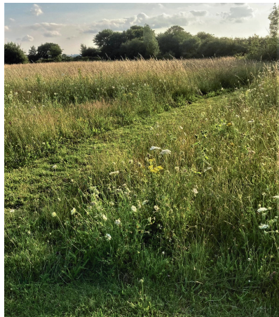
Blacksmith's Field Wildflower Meadow area - Hugo Craggs

VOLUNTEERS WANTED for the Autumn clear up in Lilley's wood, we can hopefully have some work parties and open up some of the grass land. Please contact Hugo