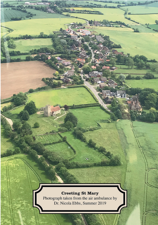
Creting St Mary