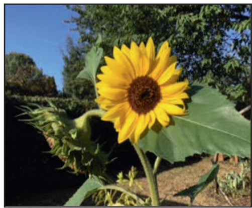
some of the SUNFLOWER STREET sunflowers gracing the village