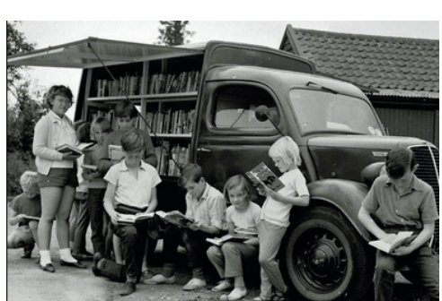
...and still going strong!

2021: 14 May, 11 June, 9 July, 6 August, 3 September, 1 October, 29 October, 26 November, No Visit in December